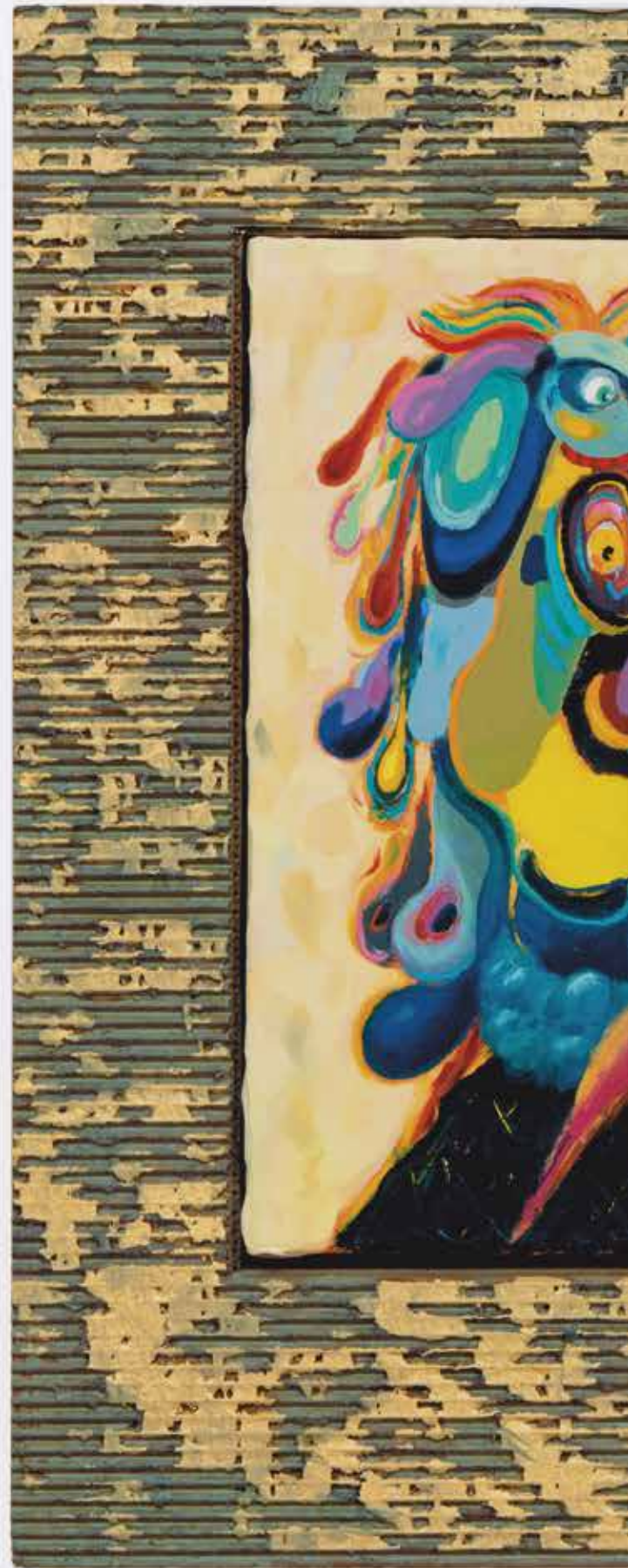
Moritz Schleime (Berlin, Germany) — Candystick and Pizzahat 2018, oil on canvas, 40 x 30 cm / 16 x 15 in each