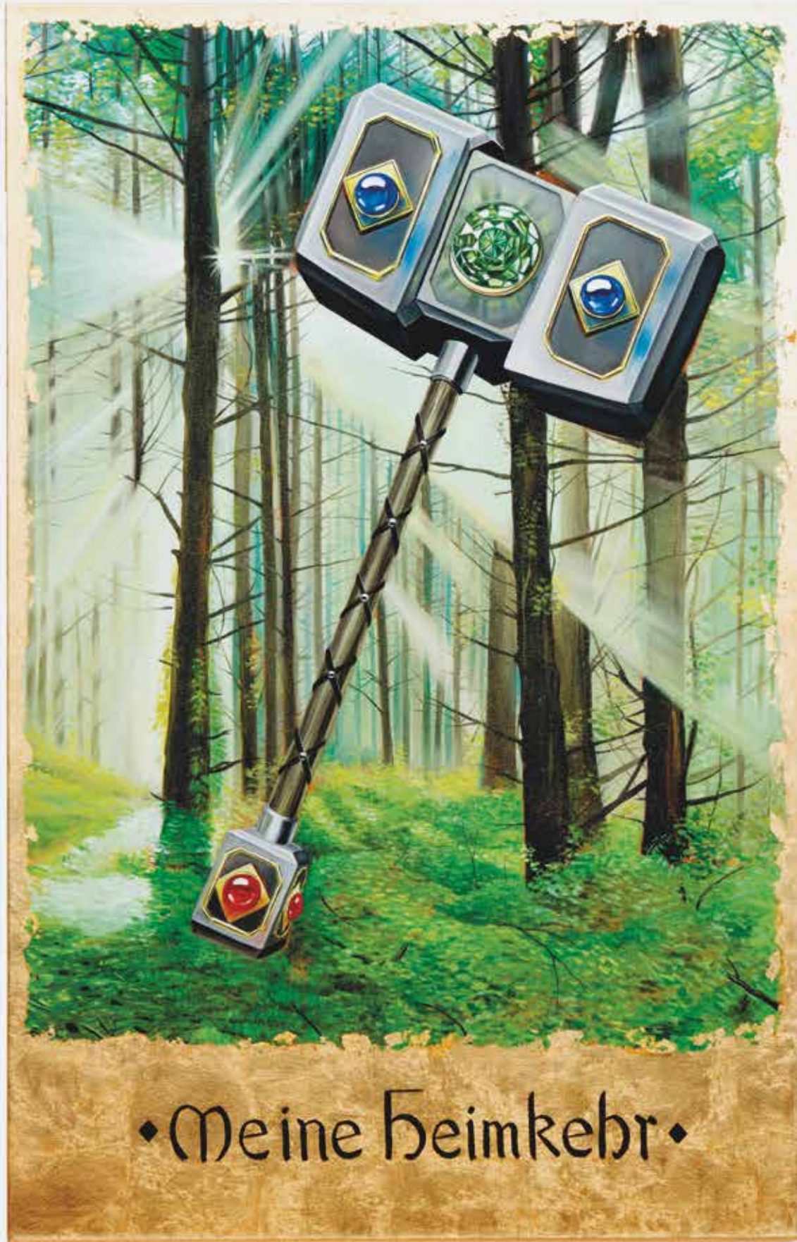
Roman Frechen (Berlin, Germany) — Meine Heimkehr 2014, oil, glitter and gold leaf on canvas, 140 x 90 cm / 55 x 35 in