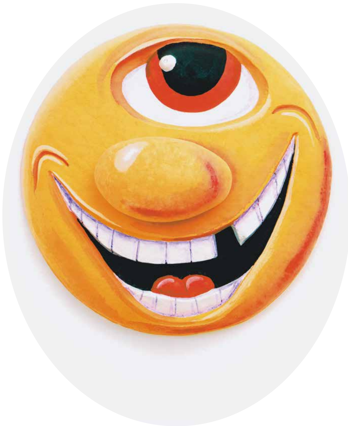
Kenny Scharf (Brooklyn, NYC, USA) — Pace Face 2014, cast handmade paper with hand-painting and Swarovsky crystal, Ø — 28 cm / 11 in