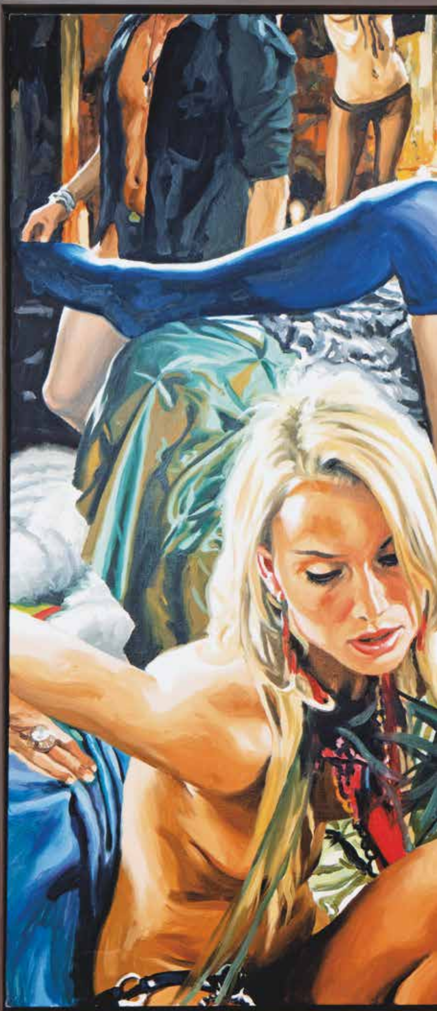
Terry Rodgers (Columbus, Ohio, USA)— The Supplicants

2010, oil on canvas, 127 x 162 cm / 50 x 64 in